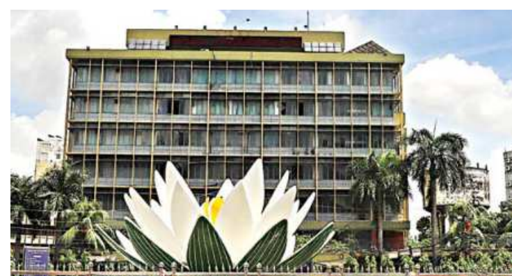
The Bangladesh Bank headquarters in the capital's Motijheel area.

The type-C companies availed financial support from the package as they were included in the package initially, said Abu