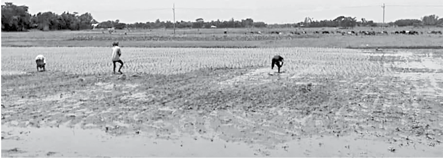
Farmers busy planting Aman saplings on land that has recently been reclaimed from Kawadighi Haor in Moulvibazar's Rajnagar upazila.