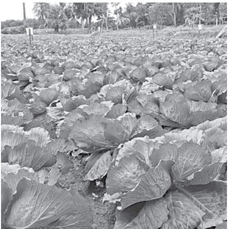
An early variety cabbage field at Narayanpur village in Faridpur Sadar upazila.