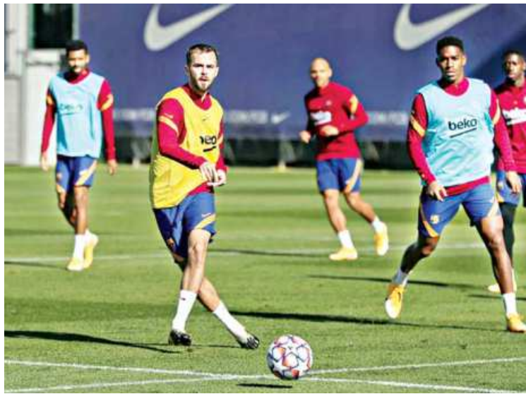
With Cristiano Ronaldo missing due to coronavirus, Rookie coach Andrea Pirlo makes a point to relative newcomers Dejan Kulusevski and Matthijs de Ligt in a training session yesterday ahead of tonight's Champions League clash against Barcelona. Miralem Pjanic, a former Juventus man, is expected to play a key role alongside the likes of Lionel Messi if the Catalans are to take away a positive result from the Allianz Stadium.