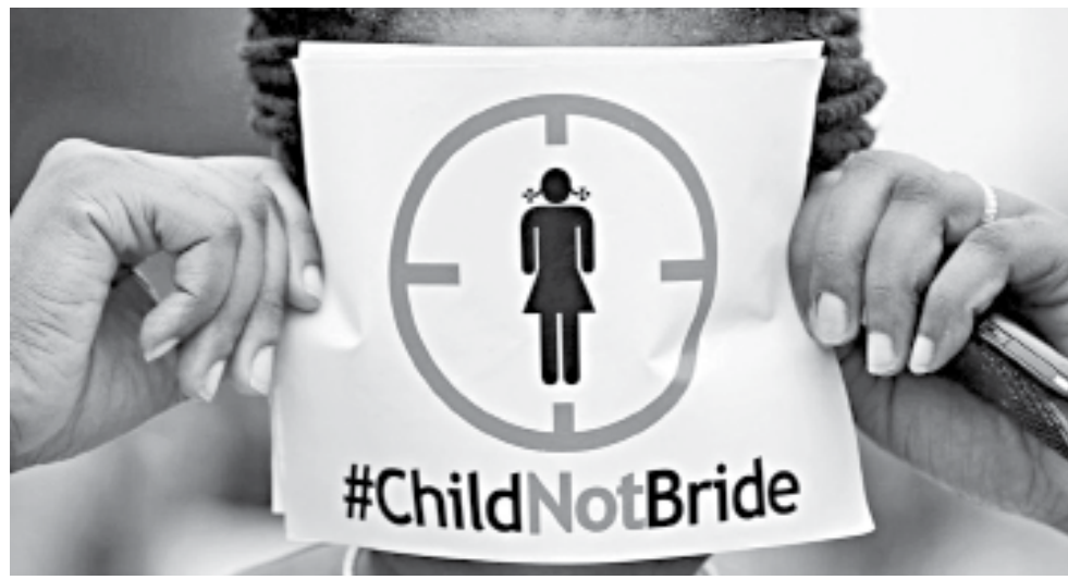
Despite making multiple laws to address women's rights, the parliament has ignored the urgency of protecting young girls that are doomed to suffer at the hands of their husbands.

Now imagine for a moment that our child bride is alive. After a month of constant, brutal torture, she somehow miraculously survives it. In that case, we have no criminal charge against the perpetrator.