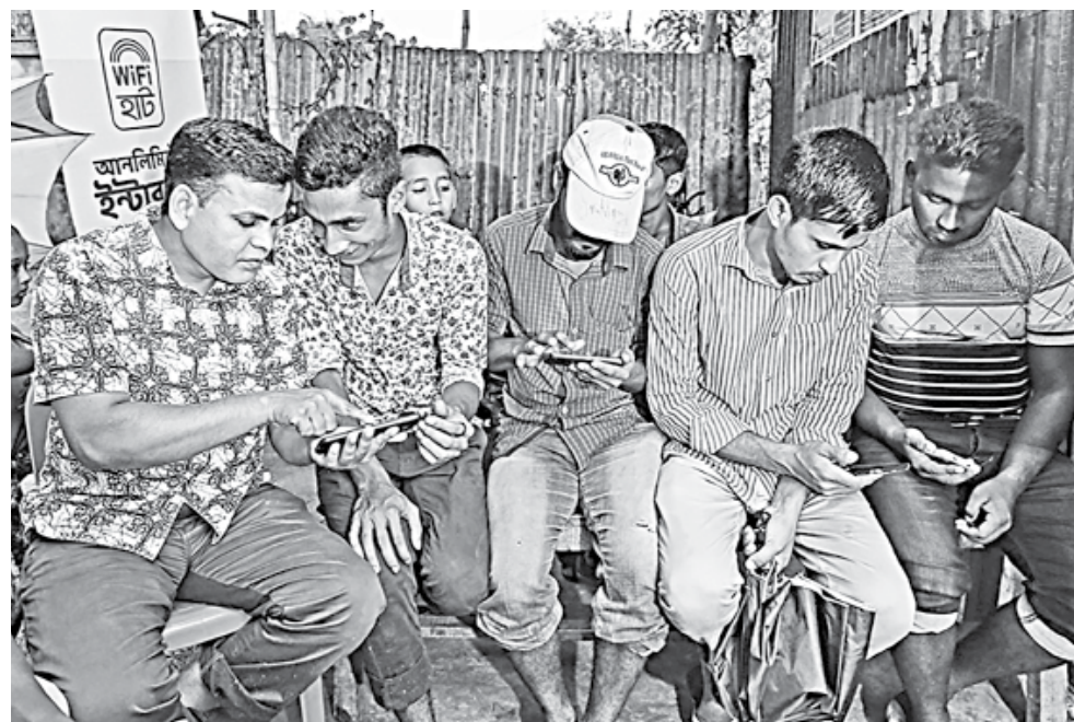
File photo of rural people using their mobile phones.

Not all citizens, however, possess an equal level of digital savviness; some are in more disadvantaged positions than others due to their socioeconomic and demographic statuses. In Bangladesh, rural and sub-urban regions lag behind the urban regions in terms of access to and usage of digital technology. For instance, internet speed there is still much slower than that in the urban regions, and its impact has been felt most strongly during the ongoing pandemic. Rural citizens face a double-fork problem where lack of access