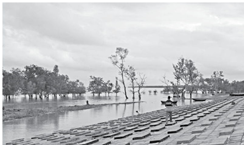
Visitors enjoy the serene beauty of Neelima Point, on the bank of Bishkhali river near Patharghata town of Barguna.

Aside from adding more facilities and services for visitors, security would be heightened around the area for their protection as well, he added.