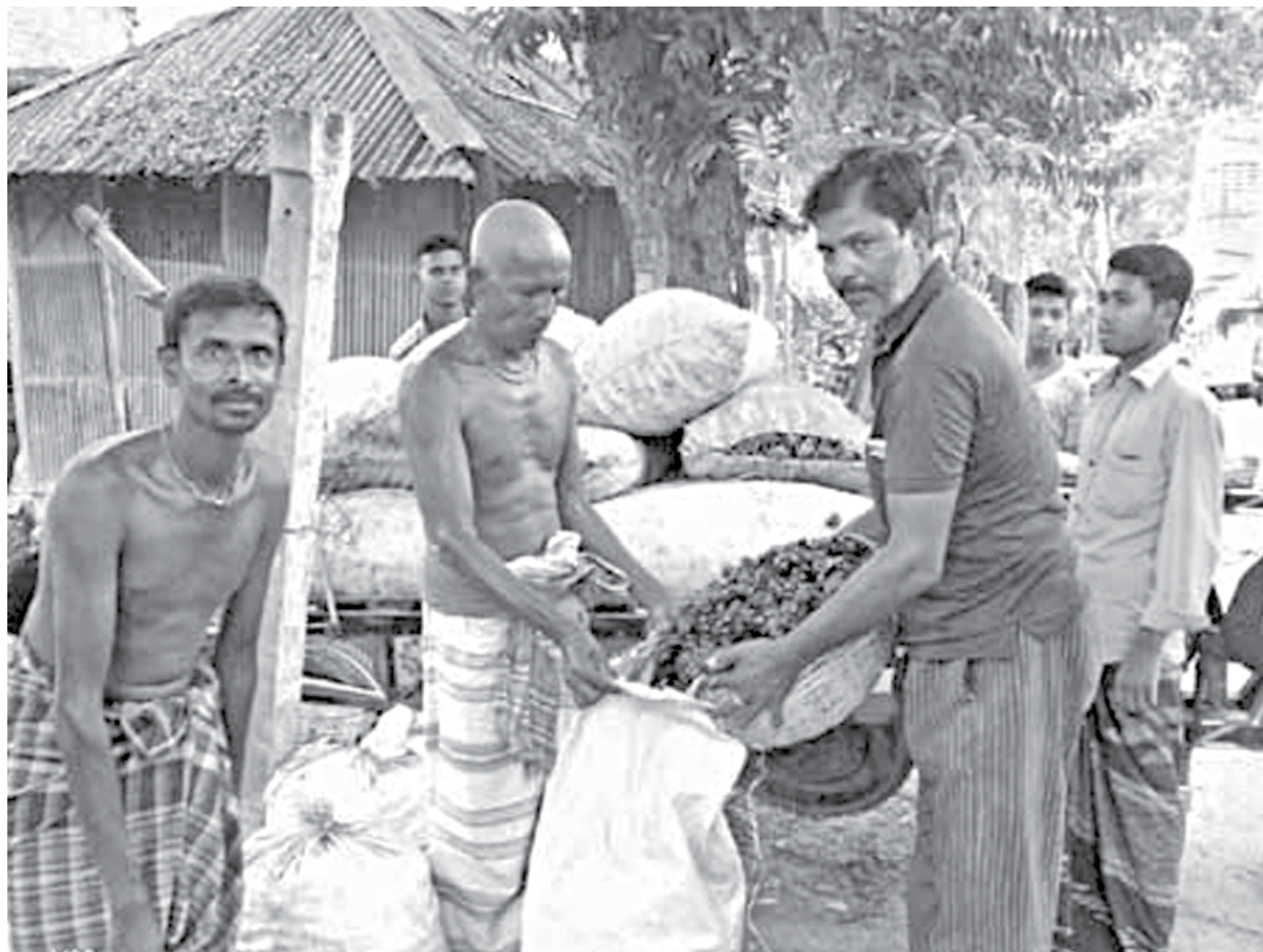
Snails being packaged for transport at a market in Sharsha upazila of Jashore.