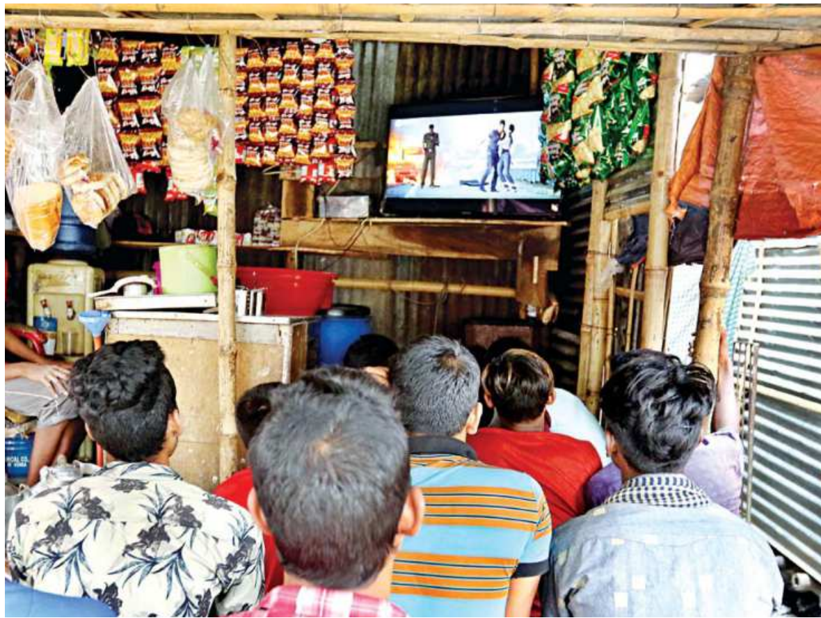
AFTERNOON DELIGHT ... Near the Malibagh rail gate in the capital, dozens of tea stalls have installed televisions and play movies from every afternoon well into the evening. Daily earners gather at the shops after a hard day of work, to unwind with some tea, snacks and entertainment. The photo was taken earlier this week.

The hotline number where the team can be reached is +8801320042055.