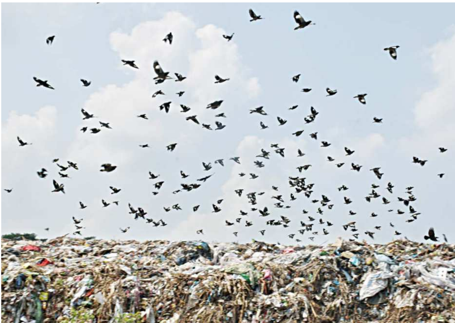
In search of food, a flock of common mynas flies over a garbage dump in Barishal city's Kaunia Puranpara Moylakhola area yesterday afternoon. The area is designated for the city corporation's dumping.