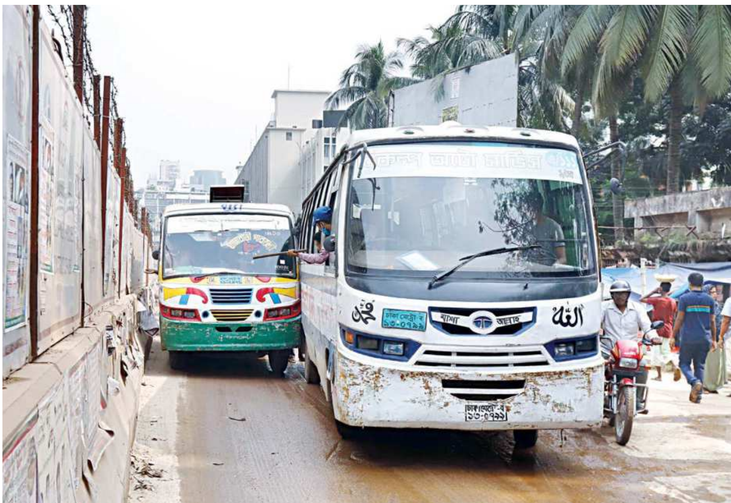
Two intra-city buses trying to overtake each other on the road in front of the Jatiya Press Club in the capital yesterday afternoon. One of the drivers is seen wielding a stick to intimidate his opponent. Such unwarranted "races" between buses are a major cause of road accidents in the country.