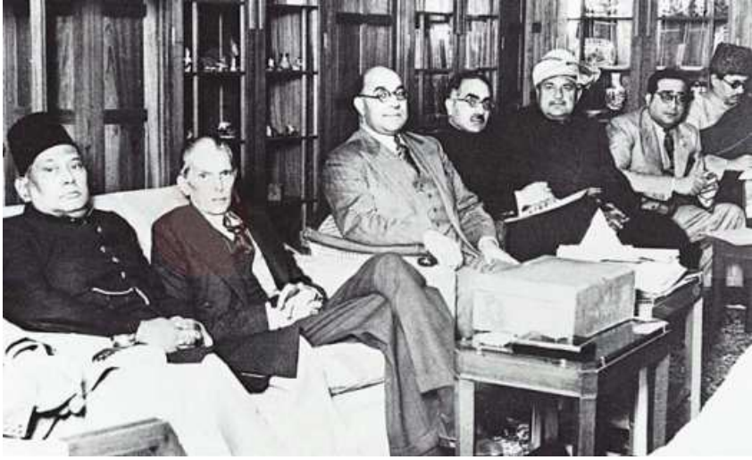
AK Fazlul Huq and Quaid-i-Azam Muhammad Ali Jinnah. Muslim League Council Meeting in Bombay in the early 1940s.