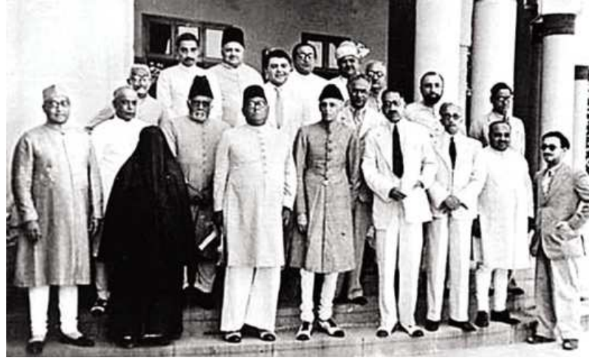
The Working Committee of the Lahore Resolution in 1940. Prime Minister AK Fazlul Huq is standing beside M. A. Jinnah.