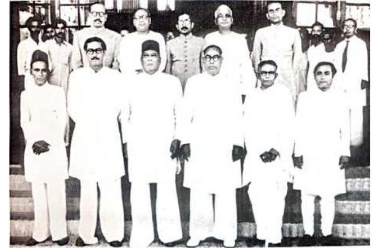
AK Fazlul Huq's short lived cabinet in East Bengal, 1954, which included Sheikh Mujibur Rahman.