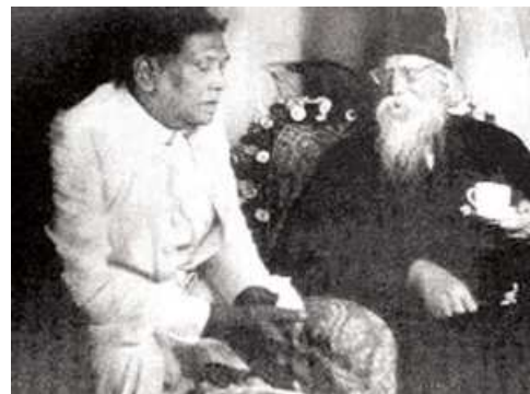
AK Fazlul Haque with Rabinranath Tagore

So it was always the stronger party that he picked up to quarrel with and never with the weaker.