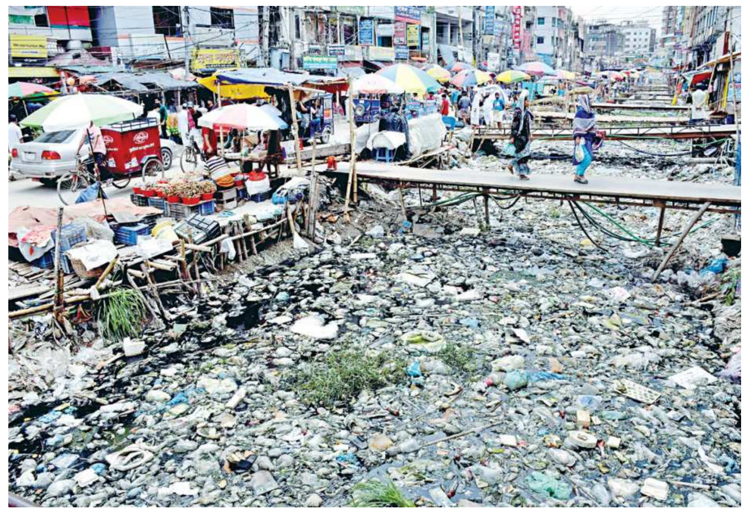
A canal in Gobindopur Bazar area of the capital's Jatrabari is chocking on garbage of households and markets nearby. People of the area have to endure the bad odour from the dirty water and insects like mosquitoes that breed there. The photo was taken recently.