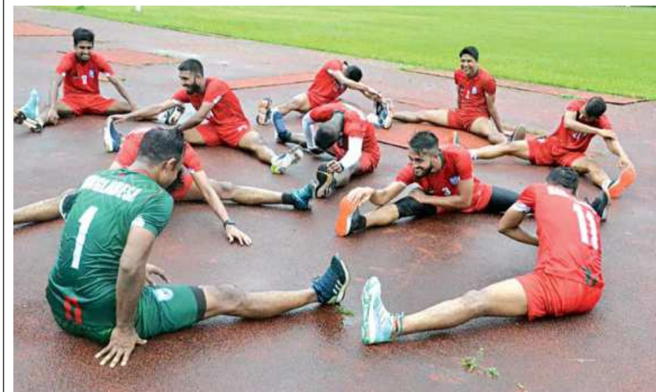
Fourteen members of the Bangladesh national football team took part in the opening day's training session at the Bangabandhu National Stadium yesterday under the guidance of local coaches, with an eye on next month's FIFA friendlies against Nepal. The booters went through Cooper test and other drills as fitness was on the forefront of the agenda. The team physio later remarked that the fitness levels of the players were satisfactory.

"But it's like Formula One. Everyone can drive a car but it is difficult to drive at 300mph in a pretty close area and then you hope that your brakes work."