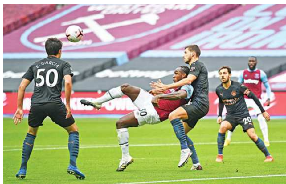
West Ham United striker Michail Antonio (C) scored a spectacular bicycle kick to give his side the lead in the 18th minute of their Premier League fixture against Manchester City yesterday. Phil Foden, though, came off the bench and equalised six minutes into the second half as Manchester City snatched a point against the Hammers.

The win consolidated Kolkata's fourth spot on the table with 12 points from 11 matches.