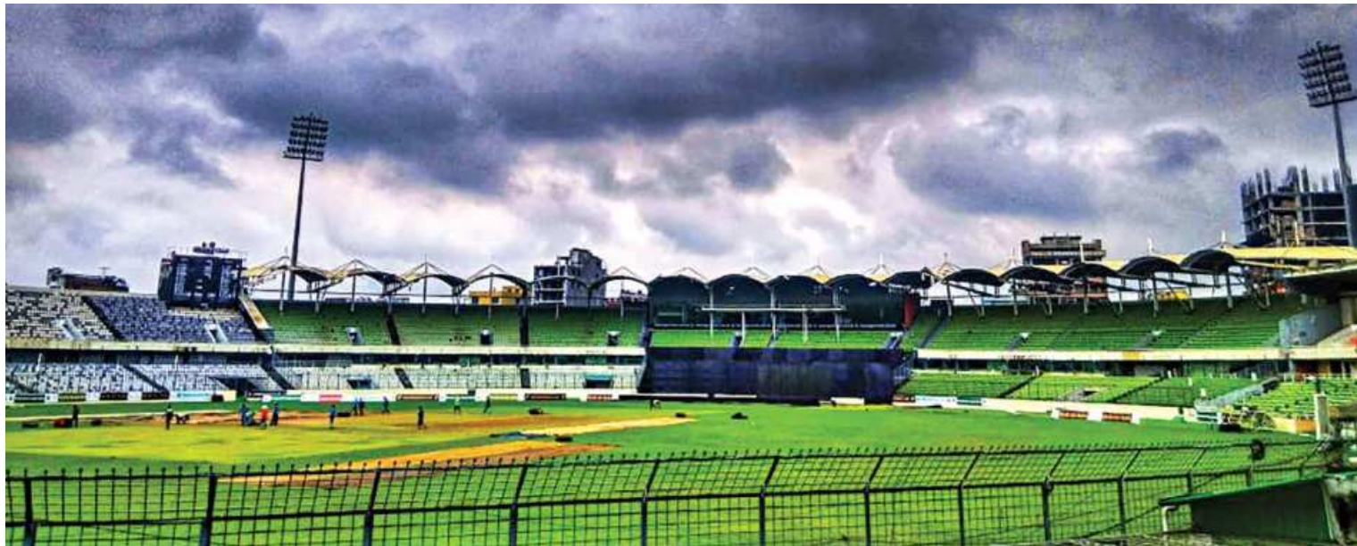
Threatening dark clouds were hovering over the Sher-e-Bangla National Stadium in Mirpur yesterday. Everybody will hope that rain will not play spoilsport in today's BCB President's Cup final. The good news however is that there is a reserve day.