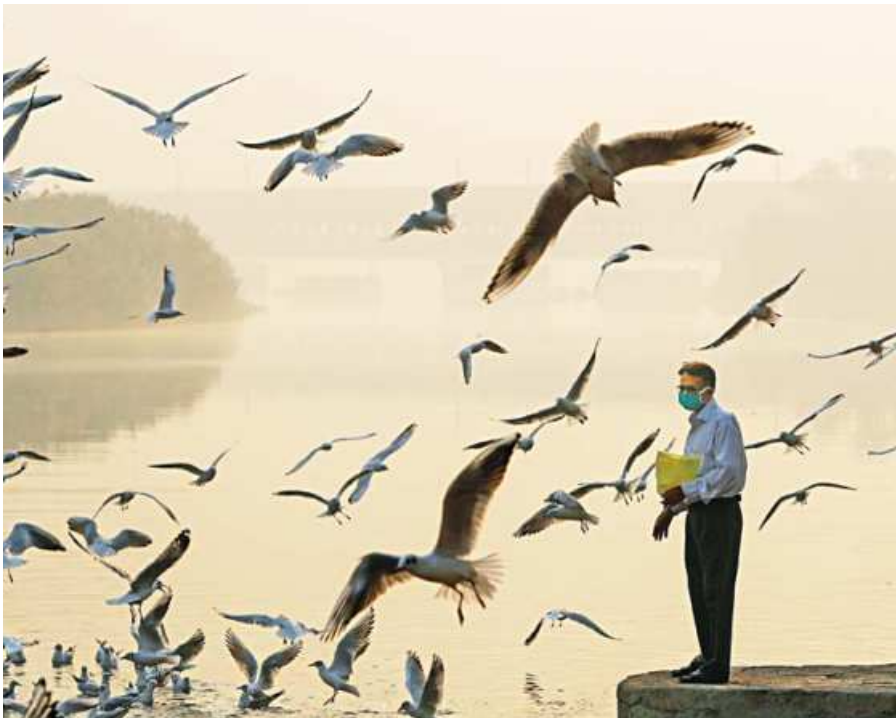
A man feeds seagulls as he stands on the banks of Yamuna river, on a smoggy morning in New Delhi, India yesterday.