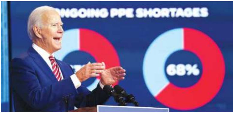
Joe Biden speaks about his plan to beat Covid-19 in Delaware and Donald Trump addresses a rally in Florida.

Trump, Harris said, pushed ‘the theme that the first Black man to be president of the United States was illegitimately there’ and referred ‘to countries on the continent as ‘shithole’ countries’ and ‘refused to condemn white supremacists.’