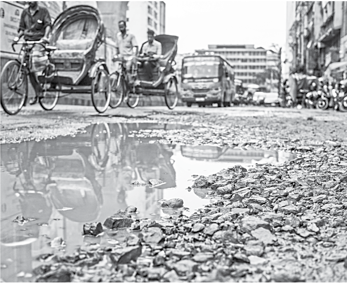
Anywhere in the world, business districts are usually the shiniest and swankiest places in a city. The capital's Motijheel, however, stands apart unapologetically, with a couple of days rain tearing away the road carpeting and exposing the undersurface, and potholes collecting rainwater. The photo was taken yesterday.

Meanwhile, a group of RU students formed a human chain on the campus protesting the murder and demanded immediate arrest of the criminals.