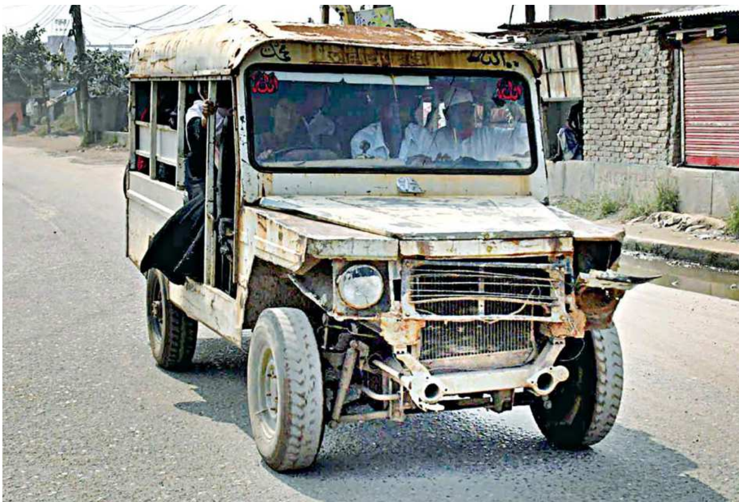
This wreckage of a vehicle carries about 15 people between Narayanganj's Pagla and the capital's Shyampur from dawn to dusk. It does not even have a license plate to pretend that it's roadworthy. At stake are people's lives on the road while the authorities turn a blind eye to the gross violation of rules. The photo was taken at Munshikhola yesterday.