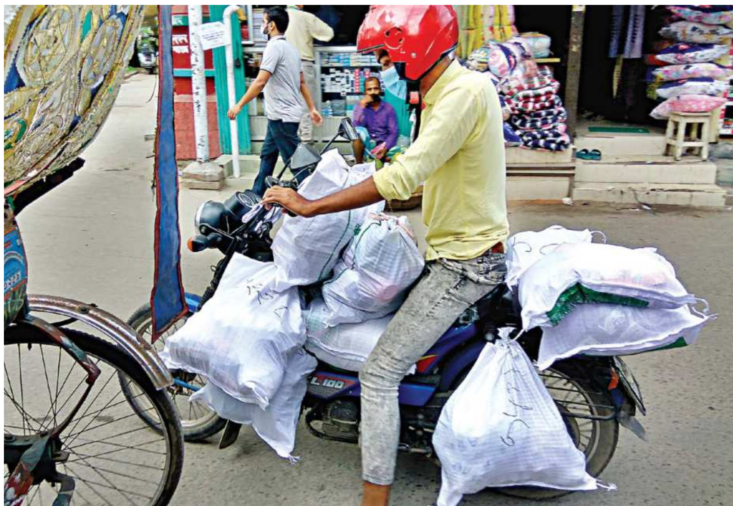
SHOPPING SPREE... Only the handle, headlights and some portion of the tyres hint that the man is sitting atop a motorcycle. He delivers groceries to online shoppers in the capital, who prefer this style of shopping amid the coronavirus pandemic. The photo was taken in the capital's Moghbazar area yesterday.