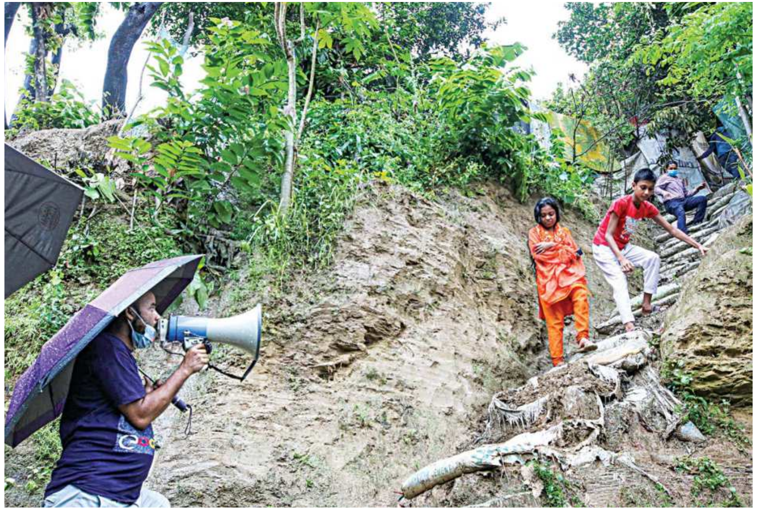
Using a megaphone, a district administration staffer asks hilltop residents in Chattogram's Shah Akbar area to move to safety yesterday afternoon. Persistent rainfall over the last few days has put hills in the area under risk of landslide.