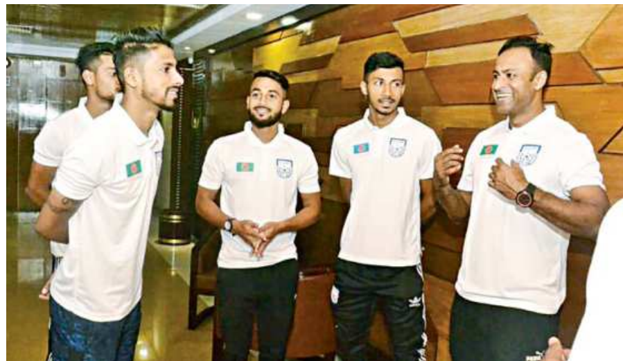
Players check in at the FARS Hotel in Dhaka yesterday as the national football team gathered after a long time for training for the upcoming FIFA friendlies against Nepal.