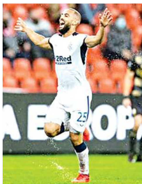
AZ Alkmaar caused a major upset on Thursday night. The Dutch side depleted by the coronavirus beat Napoli 1-0 in Naples, thanks to Dani de Wit's 57th-minute strike, as Europa League group stages began. Meanwhile, Rangers forward Kemar Roofe scored an outrageous goal during their 2-0 win against Standard Liege, wriggling past two opposition players before picking the net from the half-way line. Rangers boss Steven Gerard termed it as 'the best goal I have ever seen live.'