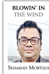
BLOWN' IN THE WIND