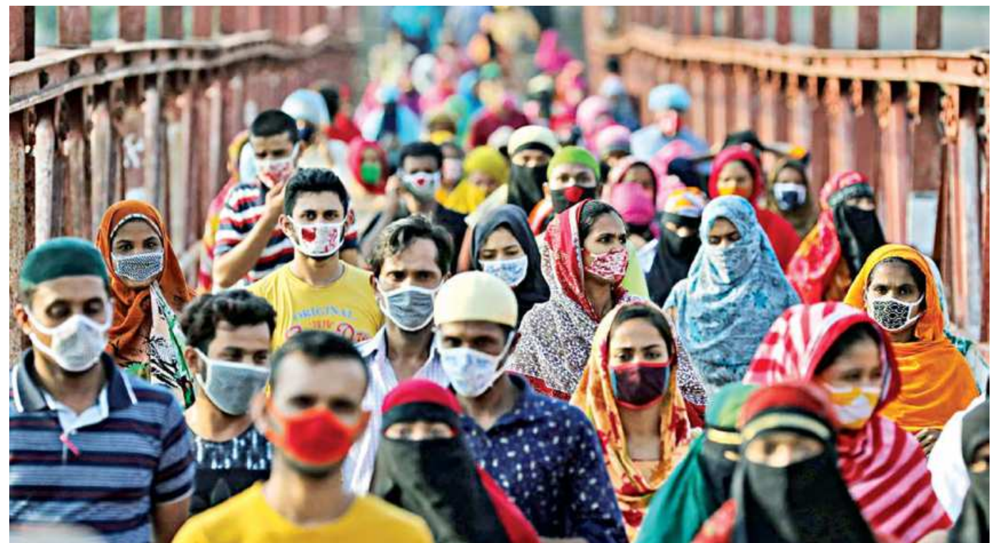
Evidence-based action and investments are needed to strengthen the Covid-19 response and build a healthier, more health-secure recovery and future for all.

Through its Solidarity trials, the WHO is facilitating Member State participation in global research and development efforts, and through the Access to Covid-19 Tools Accelerator and COVAX Facility, the WHO is working to ensure all countries have access to the life-saving