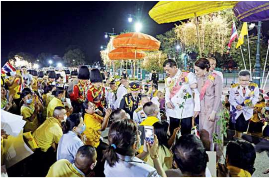
Thailand’s King Maha Vajiralongkorn and Queen Suthida greet royalists as they leave a religious ceremony to commemorate the death of King Chulalongkorn, known as King Rama V, at The Grand Palace in Bangkok, yesterday.

With the Balfour Declaration, London was seeking Jewish support for its war efforts, and the Zionist push for a homeland for Jews was an emerging political force.