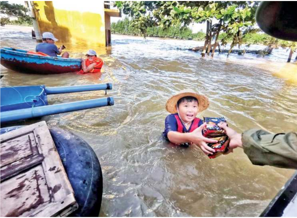
A boy gets food donation from a volunteer at a flooded area in Quang Binh province, Vietnam, yesterday. More than 100 people have died in Vietnam following weeks of severe flooding and landslides.

Attempts to use coercion to obstruct normal cooperation between countries will not succeed, ministry spokesman Zhao Lijian told a news briefing in Beijing on Friday.