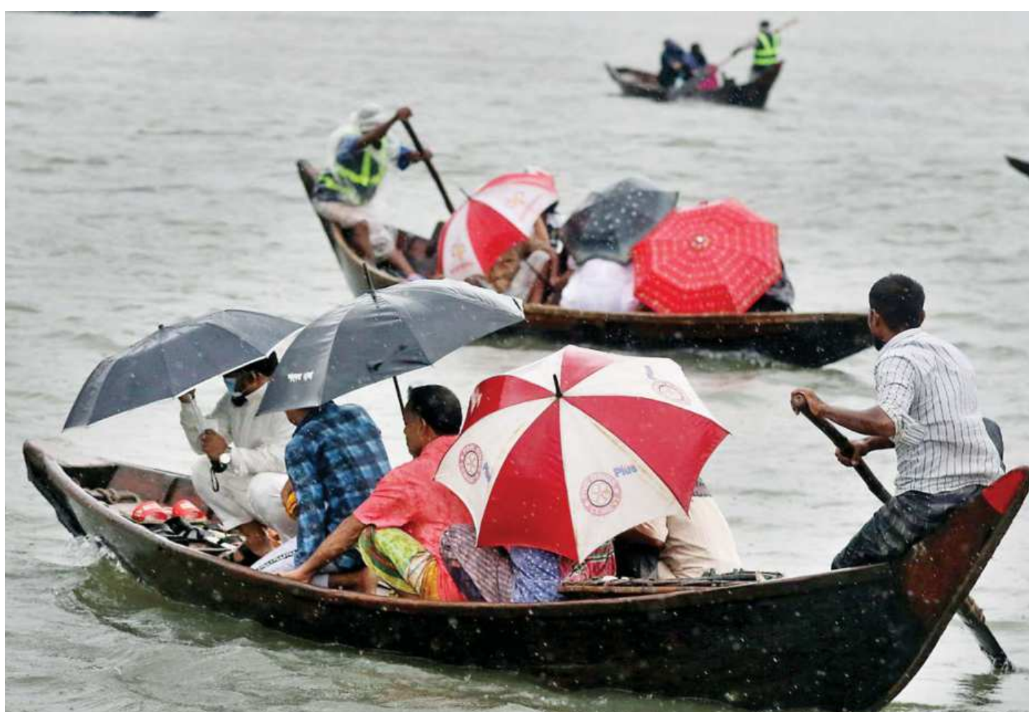
Holding umbrellas, people ride boats to go to Keraniganj across the Buriganga amid intermittent rain yesterday. Many parts of the country experienced moderate to heavy rain throughout the day due to a depression over the Bay of Bengal. The photo was taken in Babubazar area of Old Dhaka.