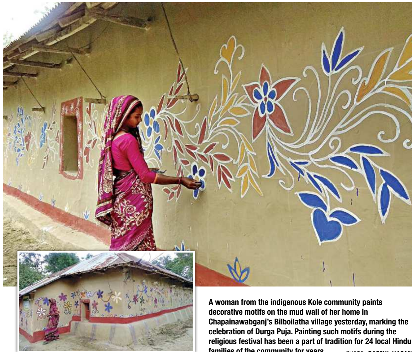
A woman from the indigenous Kole community paints decorative motifs on the mud wall of her home in Chapainawabganj's Bilboilatha village yesterday, marking the celebration of Durga Puja. Painting such motifs during the religious festival has been a part of tradition for 24 local Hindu families of the community for years.