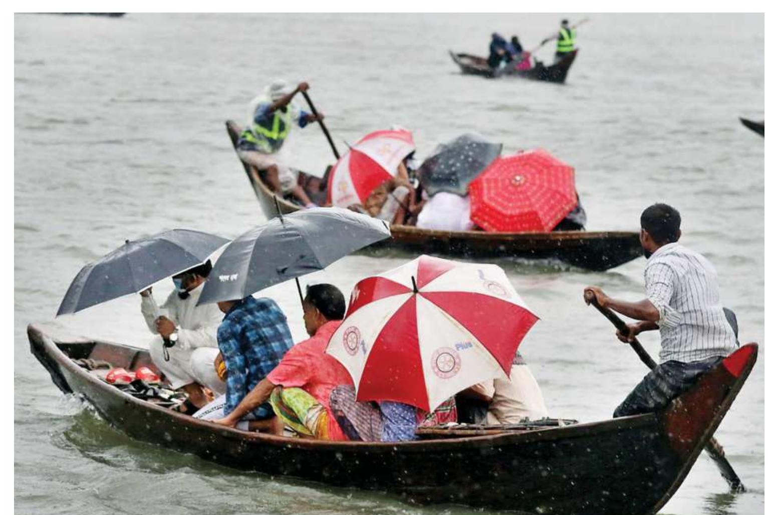
Holding umbrellas, people ride boats to go to Keraniganj across the Buriganga amid intermittent rain yesterday. Many parts of the country experienced moderate to heavy rain throughout the day due to a depression over the Bay of Bengal. The photo was taken in Babubazar area of Old Dhaka.

"There will be no annual exams for them. There will be no results, no grading SEE PAGE 2 COL 3