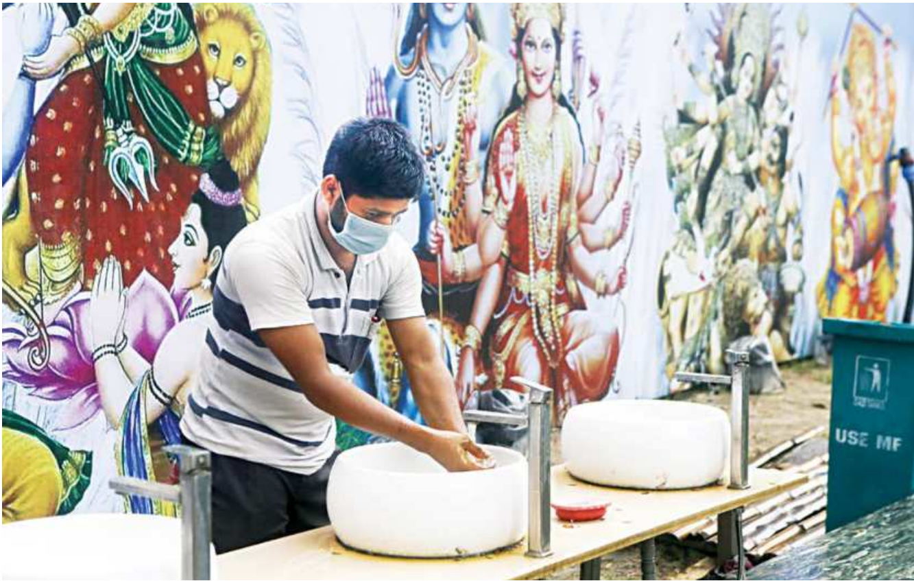
A man uses the hand-washing facilities at the Khamarbari Puja Mandap, installed as precautionary measures against the spread of the coronavirus. Durga Puja celebrations began yesterday, but due to torrential rain throughout the afternoon and fear of the Covid-19 pandemic, the turnout was much thinner compared to other years.