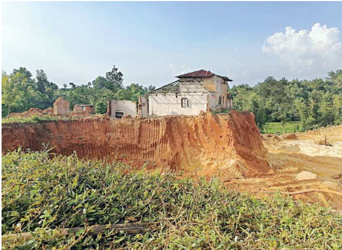
A couple of structures on what remains of a hill in Rangapahar village of Chattogram's Lohagara upazila. Dozens of such hills have been flattened in the village for the construction of Dohazari-Cox's Bazar railway link. The photo was taken recently.

Government permitted 120 acres of hill cutting in at 15 spots