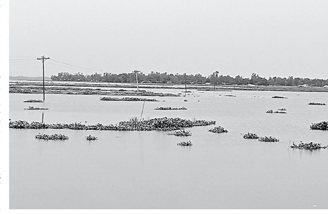
A crop field in Chalan Beel area of Sirajganj's Tarash upazila is submerged in floodwater, much to the worry of farmers.

"Every year we grow three crops amidst the flood but this time we have missed two out of three crops due to prolonged floods," he added.