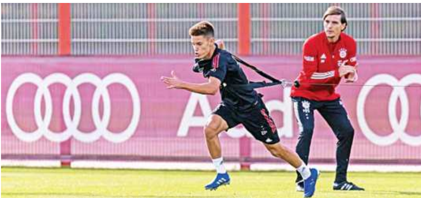
Defending champions Bayern Munich will be looking to race off the blocks when they host Atletico Madrid on Wednesday.