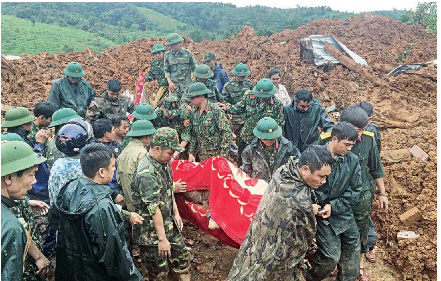
Military personnel carry a body recovered from the site of a landslide in central Vietnam's Quang Tri province yesterday. A landslide early yesterday killed at least 14 military personnel and left eight missing in central Vietnam, the government said. Intense rainfall since early October has caused the worst flooding for years, with more 80 people killed in central Vietnam.