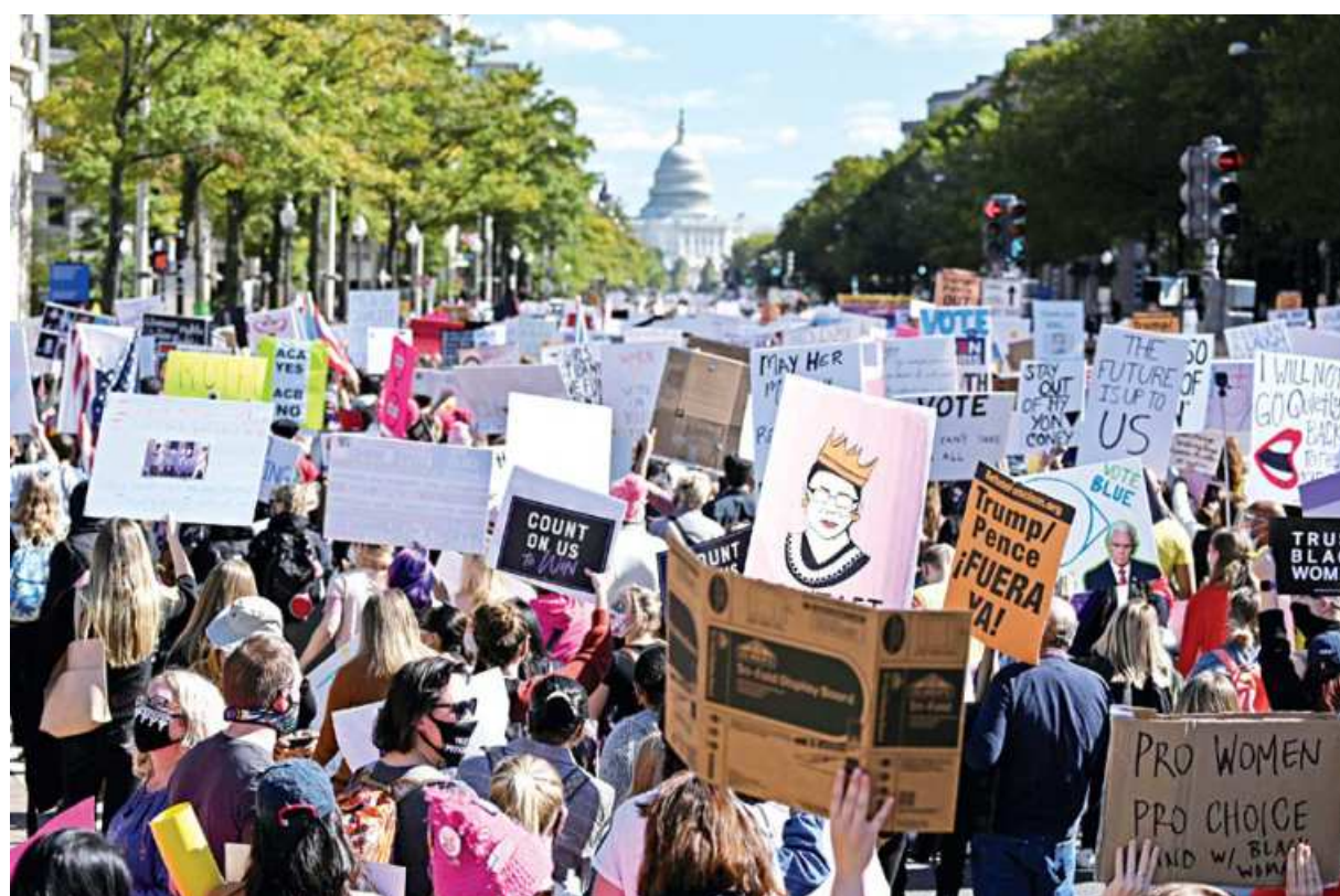
People participate in a nationwide protest against US President Donald Trump's decision to fill the seat on the Supreme Court left by the passing of late Justice Ruth Bader Ginsburg before the 2020 election, in Washington, US, on Saturday.