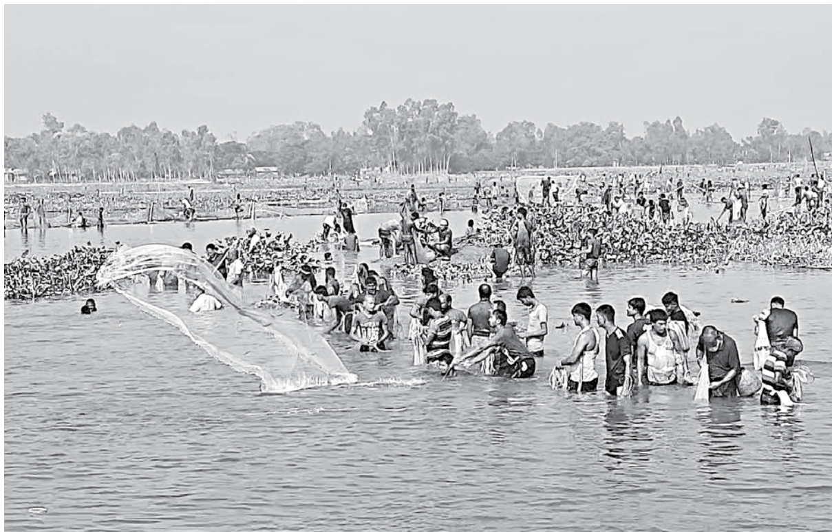
People of different villages surrounding the Burir Bandh (dam) area in Thakurgaon Sadar upazila catch fish in a festive mood. The photo was taken on Saturday.