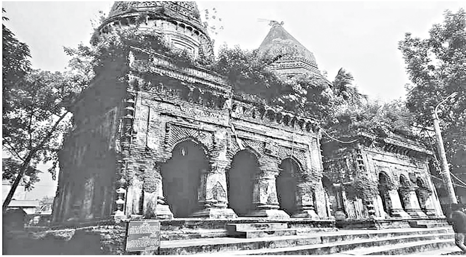
The two-century-old twin temples in Mymensingh's Muktagachha upazila are in sorry state.