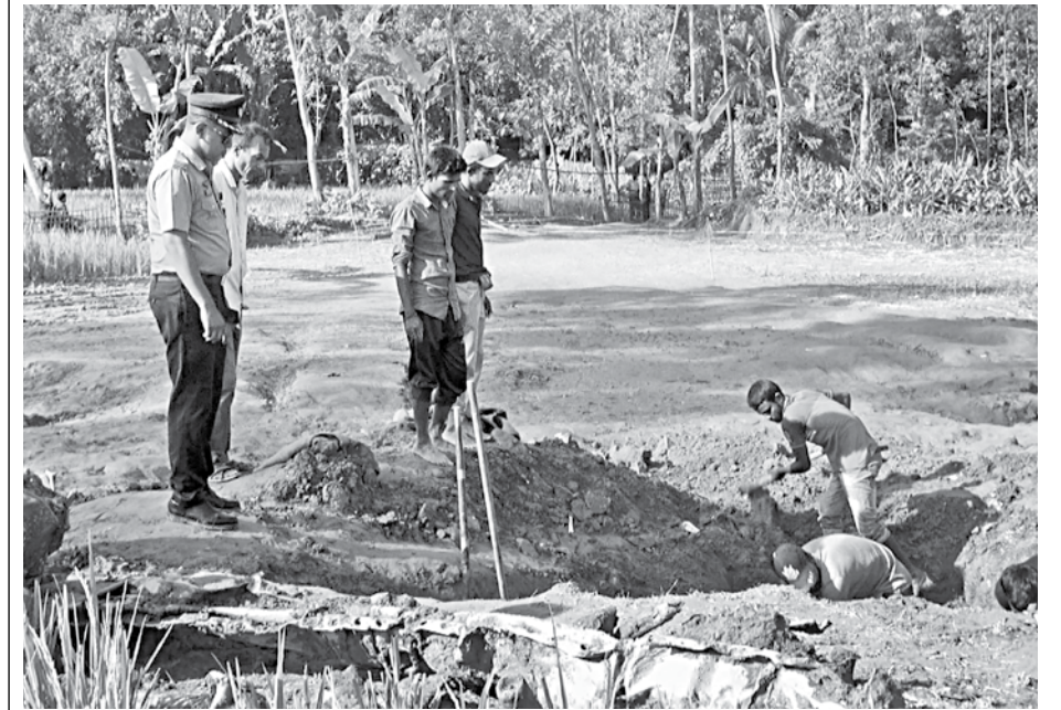
A metal part of the warplane, above, recovered in Lalmonirhat Sadar upazila on Friday. Bangladesh Air Force was digging the farmland to unearth the remains of the warplane.

The remains of the warplane unearthed so far are now in custody of BAF, he added.