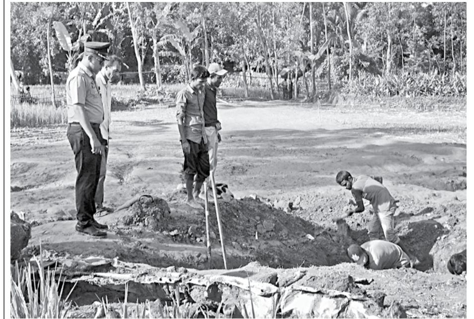
A metal part of the warplane, above, recovered in Lalmonirhat Sadar upazila on Friday. Bangladesh Air Force was digging the farmland to unearth the remains of the warplane.

The remains of the warplane unearthed so far are now in custody of BAF, he added.