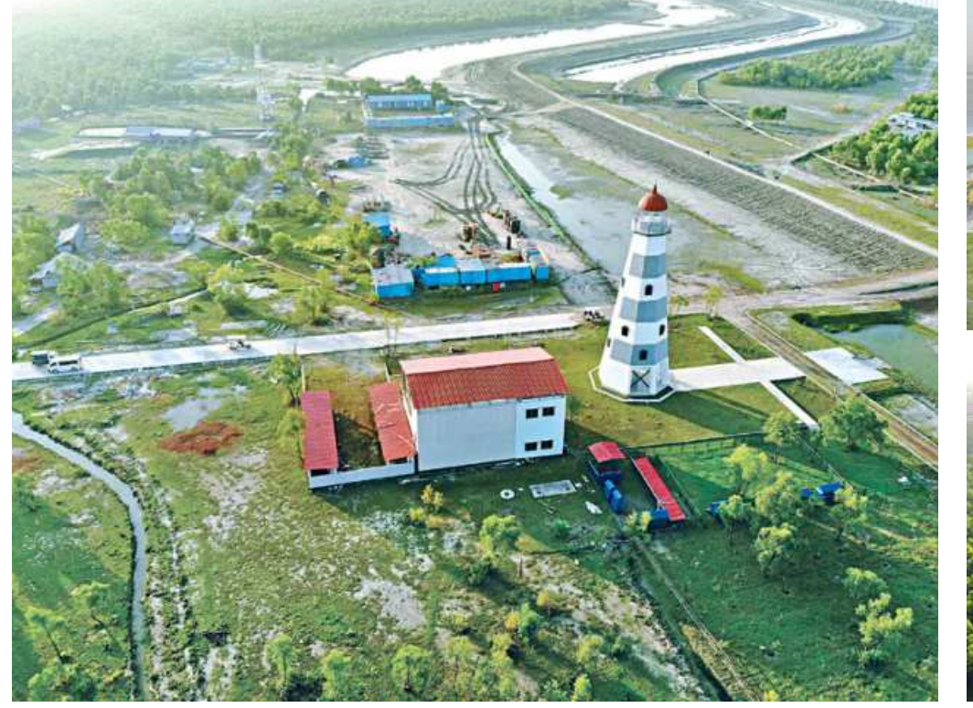
The 90-metre tall lighthouse named "Beacon of Hope", left, is perhaps the most indicative structure that showcases the government's belief in the Bhasan Char settlement despite the apprehension and opposition from national and international quarters. The Bay of Bengal seen from the island, top right, and establishments of the project surrounded by greenery, bottom right.

Police later recovered the bodies and sent those to Netrakona General Hospital morgue for autopsies.