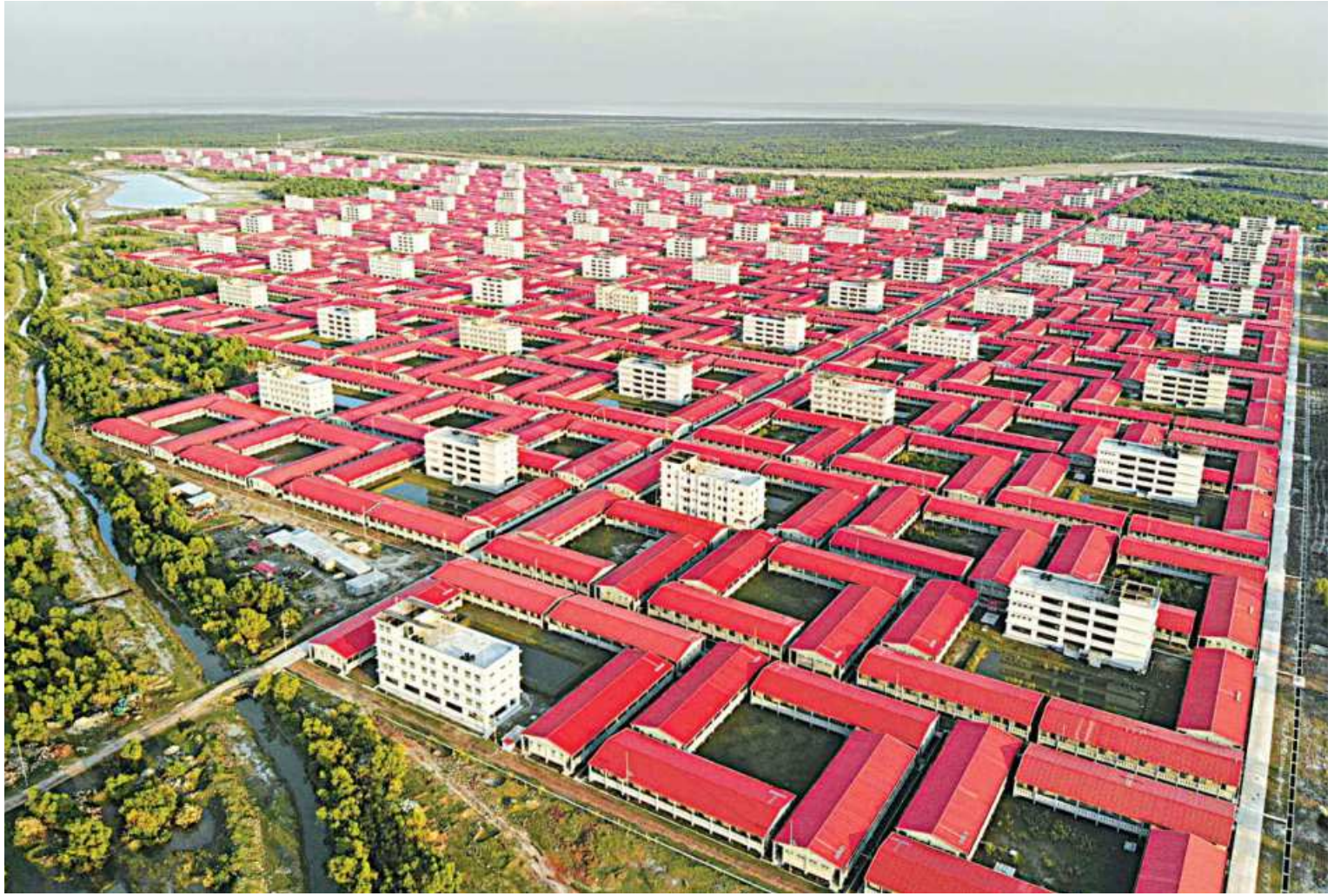
This aerial view of Bhasan Char shows a portion of the housing facilities that has been built on the island to relocate the Rohingyas from Cox's Bazar. The authorities say that the housing is ready to host 1 lakh Rohingyas. Multiple international organisations, however, expressed doubt over the relocation plan.