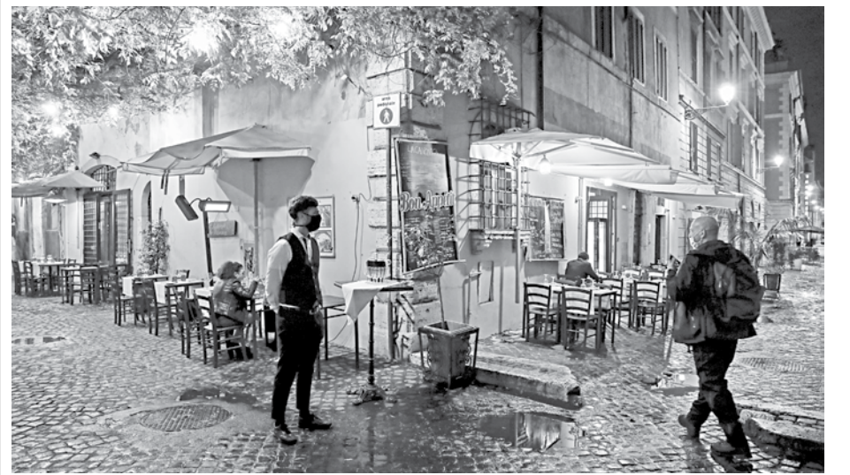
Empty tables are seen outside a restaurant in Rome as Italy tightens regulations in an effort to control rising Covid-19 infections, on October 14.

employment in the poor south of the country. Italian Prime Minister Giuseppe Conte is expected on Sunday to also announce new measures to curb the steady spike in COVID-19 cases over recent weeks. One of the European countries worst hit by the pandemic, Italy has forecast a 9% economic contraction for 2020 and a budget deficit equating to 10.8% of gross domestic product. The expansionary package is expected to keep Italy's deficit next year to 7% of economic output, up from a 5.7% forecast in April, reflecting the additional spending. Italy has forecast economic growth of 6% in 2021. Expansionary measures next year will total 40 billion euros, including cheap loans and grants from the European Union's Recovery Fund, Gualtieri told lawmakers this month.