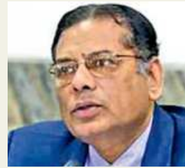
ZAHID HUSSAIN Former lead economist of WB

"Compared to other countries, Bangladesh's GDP is more dependent on domestic demand and this is a strength for the country. The economy is opening up but it has not reached its full capacity."