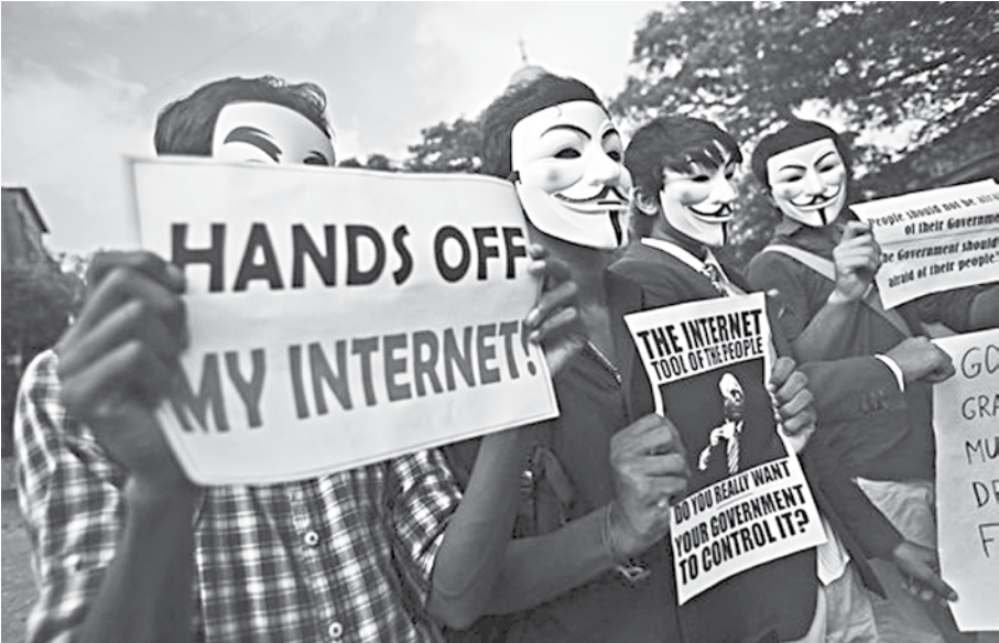
An informed public is the most effective bulwark against rumours, fake news and attempts to disrupt peace.

those forces of destabilisation. Without an elaboration, we consider such statements to be disingenuous at best and downright harmful to the nation at worst. The best way to fight a "threat to peace" and the spreading of "fear, concern and confusion among the general public" is to prepare the public to fight such attempts by sharing information and equipping them to counter rumours and false information. Telling the public of imminent danger without any explanation