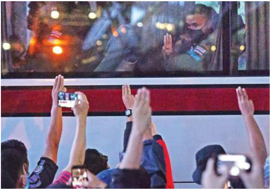
A policeman gives the three-finger salute to pro-democracy protesters from a police bus at Wongwian Yai in Bangkok yesterday, as they continue to defy an emergency decree banning protests.

The Biden campaign rejected the assertions of corruption in the report.