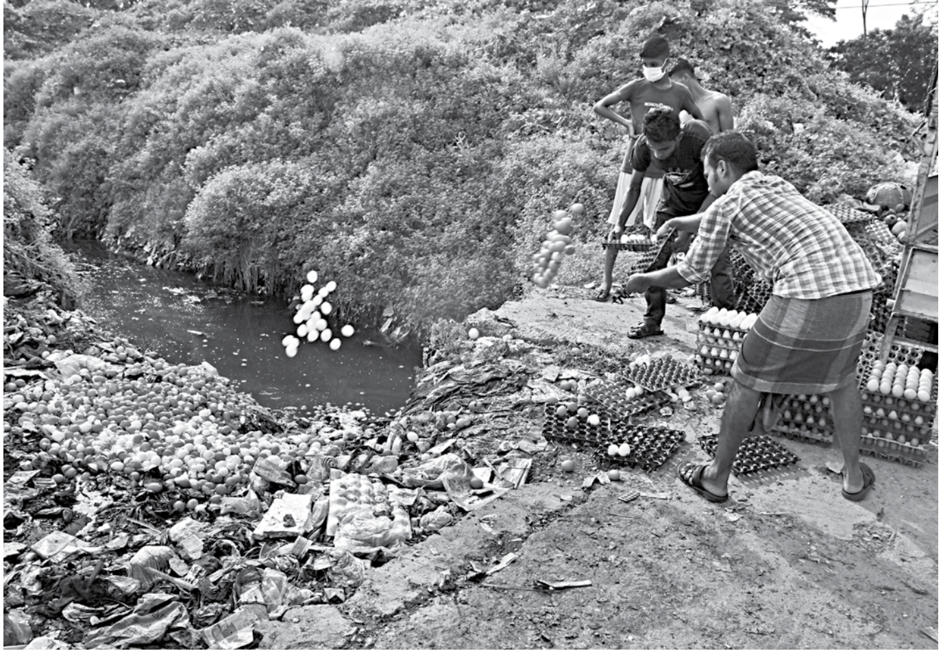
Around 29,000 rotten eggs, seized by Directorate of National Consumer Rights Protection from a business in Barishal, being destroyed on the bank of Jail Canal at the city's Kawnia Puranpara Moilakhola yesterday.

Expressing gratitude to the university authorities for opening the door to higher education, the students said they will be able to put an end to the discrimination against them if an equity based society can