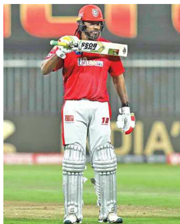
Chris Gayle's introduction to this year's IPL was delayed by a stomach bug, but once fit and selected, the 'Universe Boss' showed his prowess with a quick-fire fifty against Royal Challengers Bangalore on Thursday night, helping the beleaguered Kings XI Punjab to a much-needed victory. "It is the Universe Boss batting, how can I be nervous?" the left-hander said after the win, referring to the last-ball victory.

Wimbledon's statement read: "Our overriding priority will continue to be the health and safety of all of our stakeholders, in particular our guests, our staff, and our competitors."