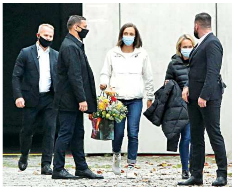
Poland's Iga Swiatek, the French Open winner, walks after a news conference in Warsaw, Poland on Wednesday.

Swiatek was the first Polish woman to reach the Roland Garros final in 81