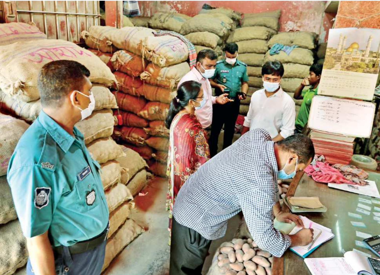
After recent complaints against vendors asking exorbitant prices for potatoes, Directorate of National Consumers' Right Protection yesterday launched a drive at Old Dhaka's Farashganj and fined several wholesale potato shops for hiking prices and not putting up price lists. Although the wholesalers were supposed to sell potatoes for Tk 23 per kg, they were being sold for Tk 30-35. Earlier, authorities said initiatives will be taken to drop prices within a day or two. Sources said cultivation was hampered by flood, and farmers and traders are releasing potatoes slowly into the market to make more profit.

Dhaka-5 and Naogaon-6 constituencies are going to by-polls today with the participation of two major political parties -- Awami League and BNP. EC sources said necessary measures to follow health guidelines have been taken during the by-elections amid the coronavirus pandemic. Electronic Voting Machines will be used in both the by-polls which will be held from 9am to 5pm without any break. Kazi Monirul Islam of AL, Salahuddin Ahmed of BNP, Meer Abdus Sabur of Jatiya Party, HM Ibrahim Bhuiyan of Gonofront, Ansar Rahman Shikdar of Bangladesh Congress and Arifur Rahman of National People's Party are competing in the Dhaka-5 by-polls. The Dhaka-5 parliamentary seat fell vacant following the death of AL MP Habibur Rahman Mollah on May 6. In Naogaon-6, Anwar Hossain from AL, Sheikh Md Rezaul Islam from BNP and Khandokar Intekhab Alam from National People's Party are contesting. The seat fell vacant following the demise of AL MP Israfil Alam on July 27. On September 3, the EC announced the by-election schedules for the two parliamentary constituencies.