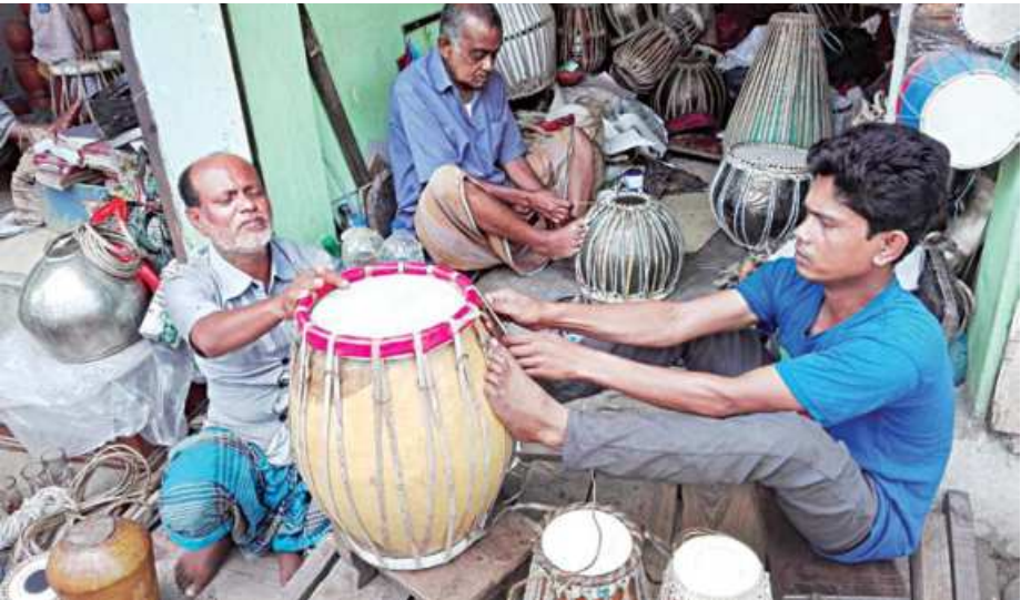
Two artisans working on a musical instrument ahead of the festival.