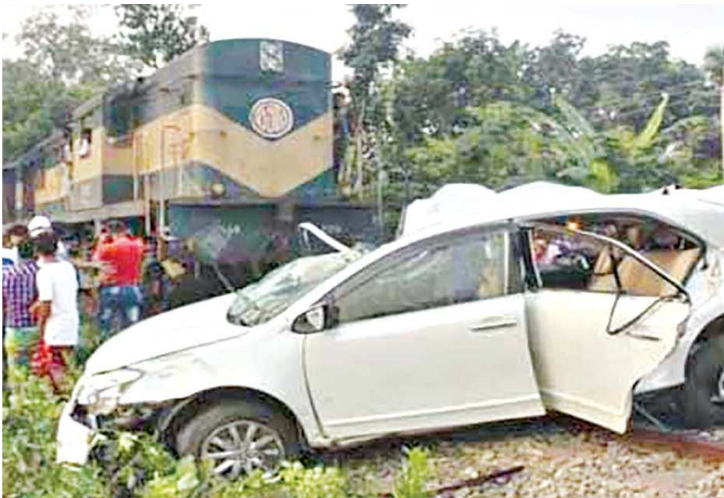
A mangled car lies on the railway track in Noapara of Jashore's Abhaynagar upazila yesterday afternoon after Mahananda Express hit it on a level crossing in the area. The accident left four people dead.