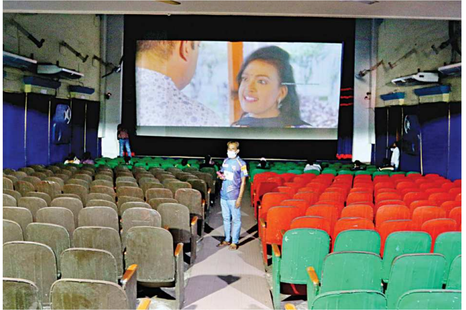
Movies return to cinemas but not the audiences. Only a few people turn up at Chitramohol Cinema in the capital's Tantibazar yesterday, the first day of reopening cinemas in the country after being closed for more than six months amid Covid-19 pandemic. Under the health guidelines, cinemas are allowed to operate at half the capacity for the time being.