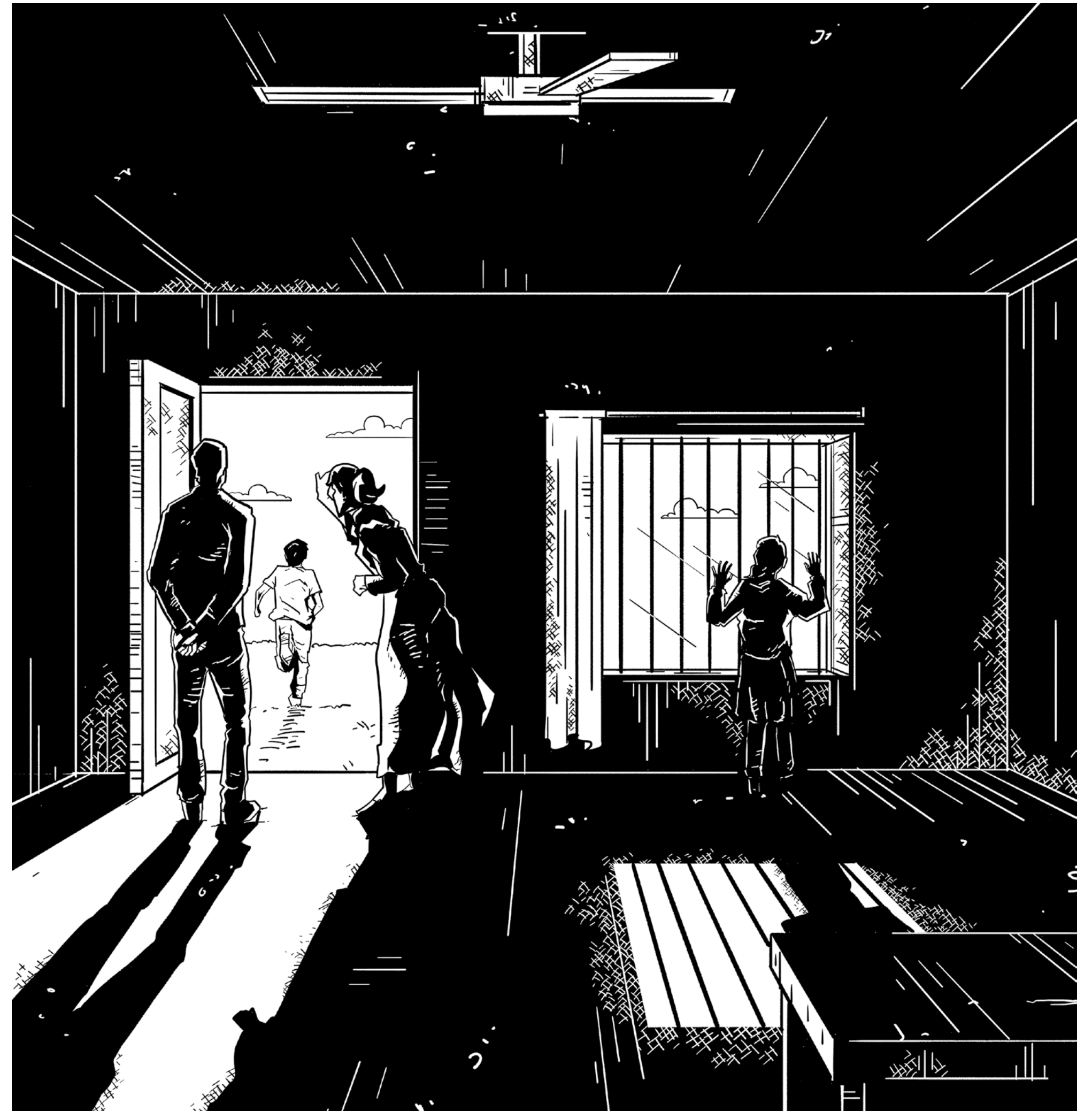
ILLUSTRATION: RIDWAN NOOR NAFIS

ual was asked to leave the bus. Such stories give us hope that if raised right, the children in our society can truly grow up to be model individuals and citizens.