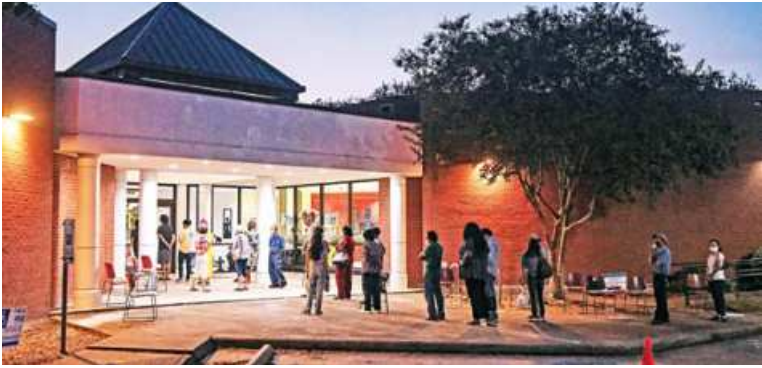
People wait in line to cast their ballots for the upcoming presidential election as early voting begins in Texas, on Tuesday.