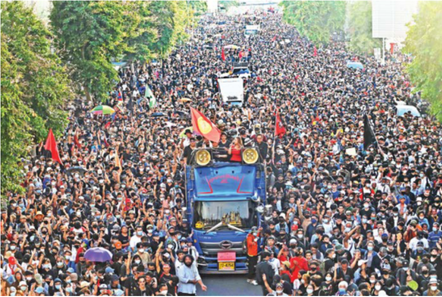
Student leaders, boarded on a truck, lead a procession as pro-democracy protesters march towards the Government House during an anti-government rally in Bangkok, yesterday.

"They must not touch the institution," he told reporters.