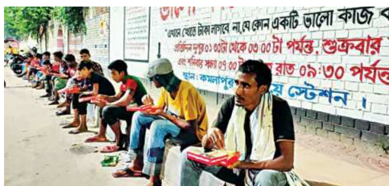
Samaritans enjoy a filling meal at Bhalo Kajer Hotel in Kamalapur.

If one crosses the area between 1:30pm and 3pm from Sunday to