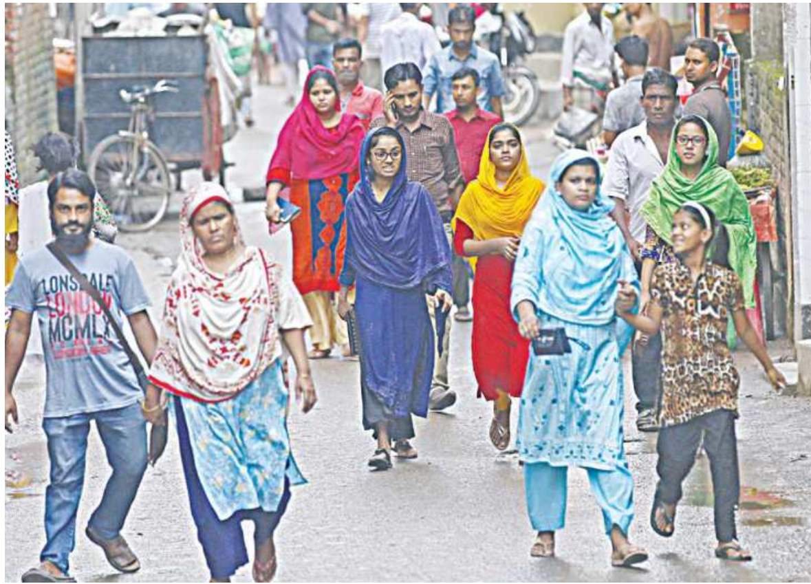
Workers of readymade garment factories leave their workplaces for lunch in the capital's Agargaon yesterday, with not a mask in sight. The World Bank in a report yesterday said one in 10 people of the capital may have already been infected with the novel coronavirus.