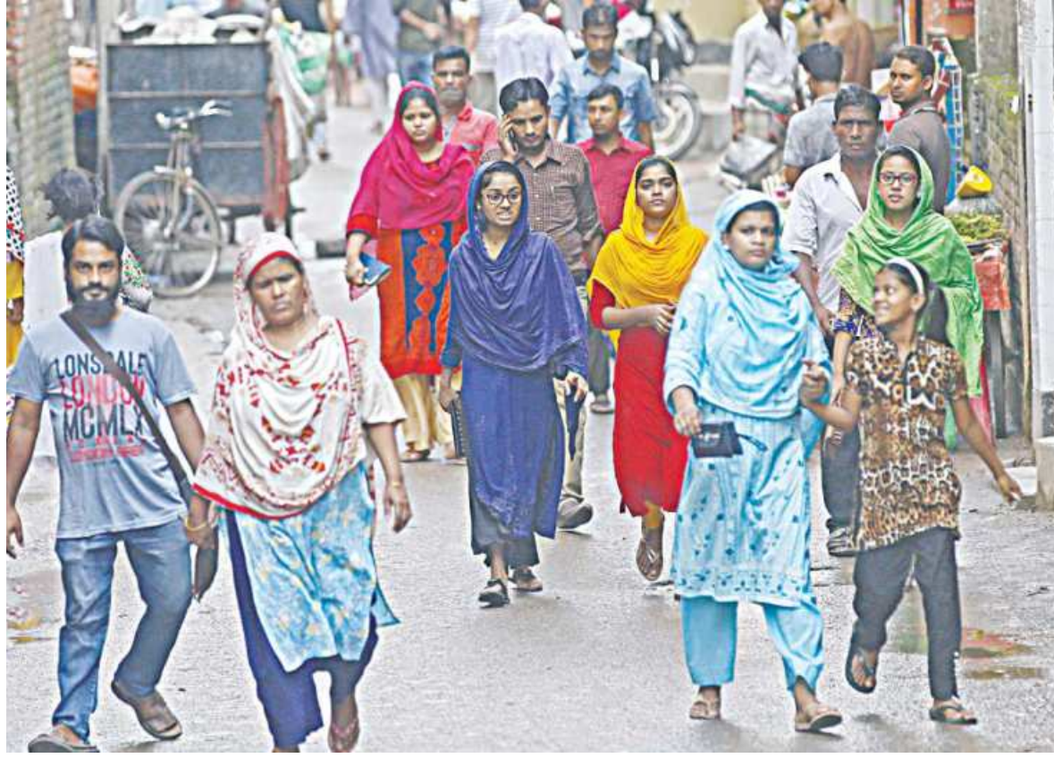
Workers of readymade garment factories leave their workplaces for lunch in the capital's Agargaon yesterday, with not a mask in sight. The World Bank in a report yesterday said one in 10 people of the capital may have already been infected with the novel coronavirus.