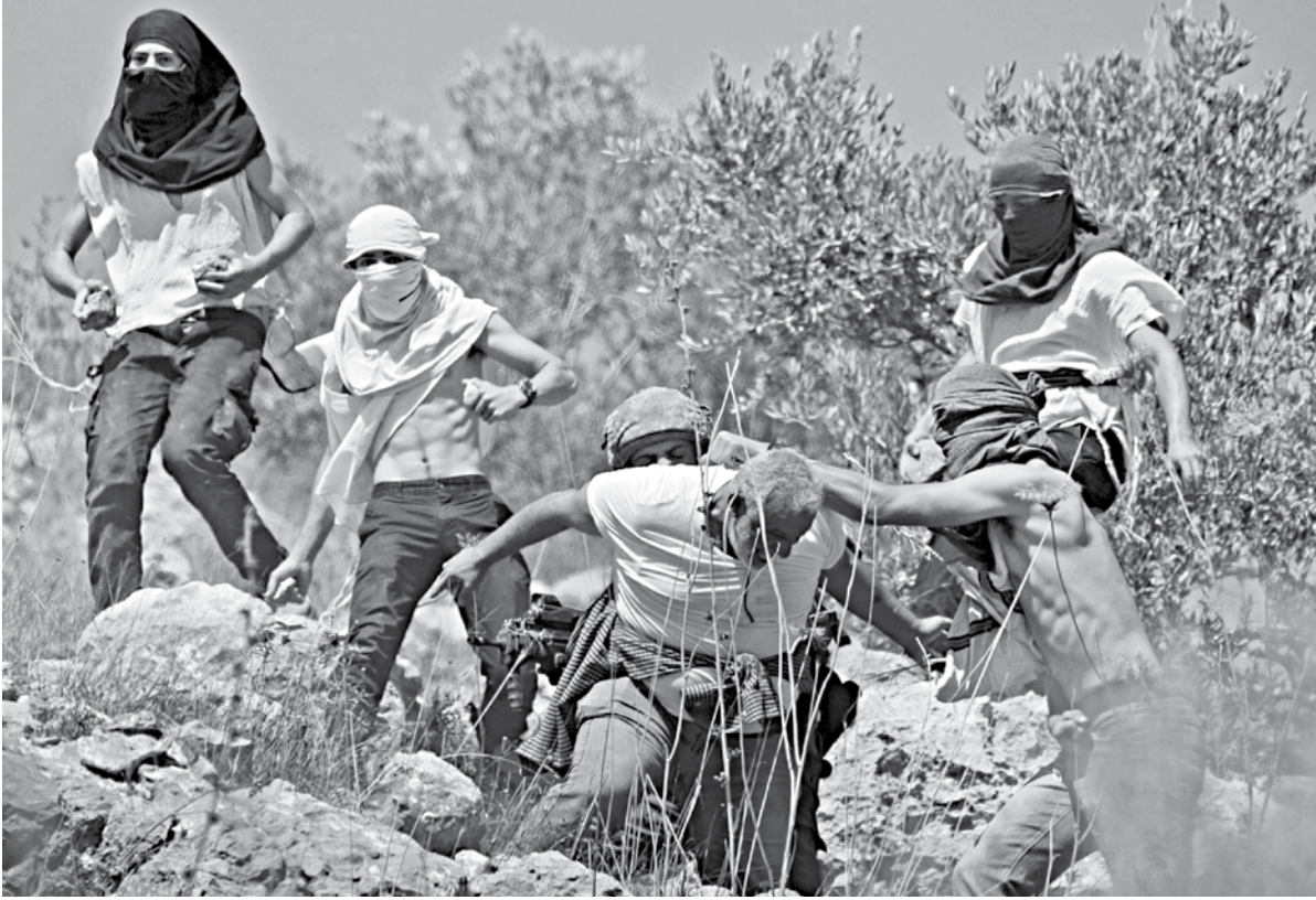
Masked Israeli settlers attack Palestinian olive farmers from the village of Hawara, on fields near the settlement of Yitzhar, yesterday.