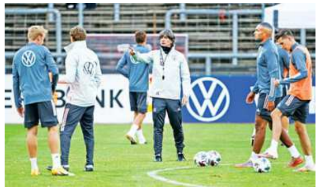
The international break could not have come at a worst moment for Germany, who face Turkey in a friendly in Cologne on Wednesday. They are currently dealing with growing infection figures around Cologne, which means the match will be held without fans.