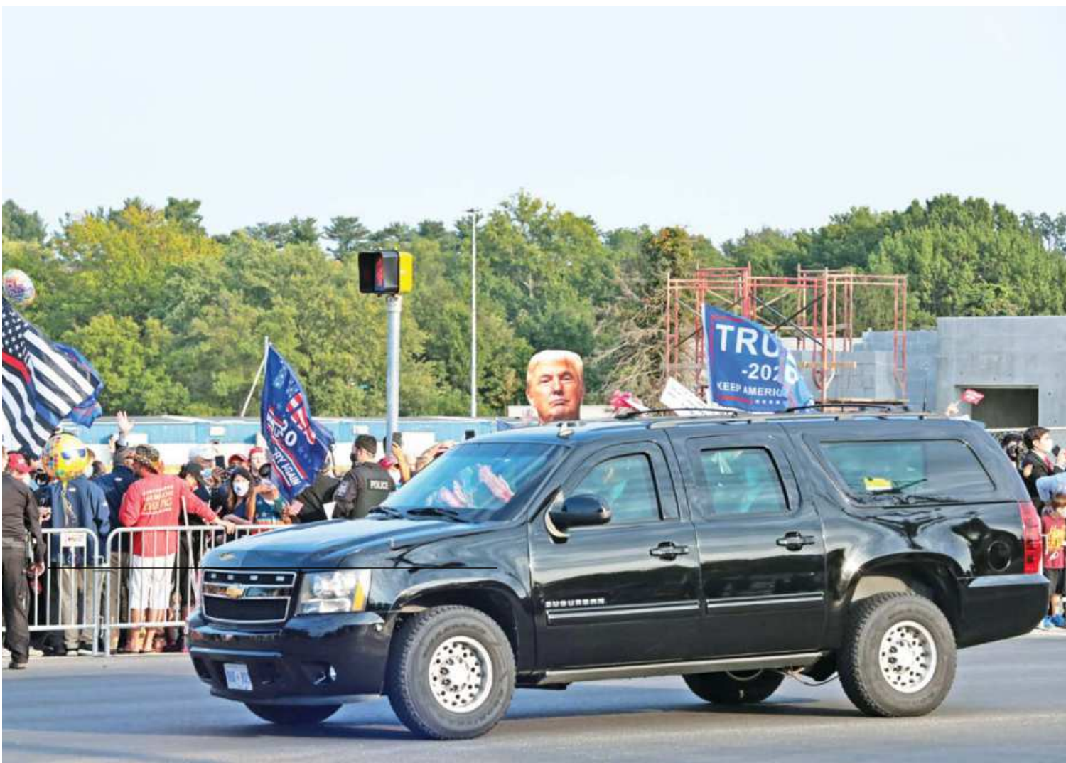
US President Donald Trump rides by in the presidential motorcade in front of the Walter Reed National Military Medical Center, where he is being treated for the coronavirus disease in Bethesda, Maryland, US on Sunday.

Meantime, Democrats are insisting on an in-person vote and demanding that the process be delayed.