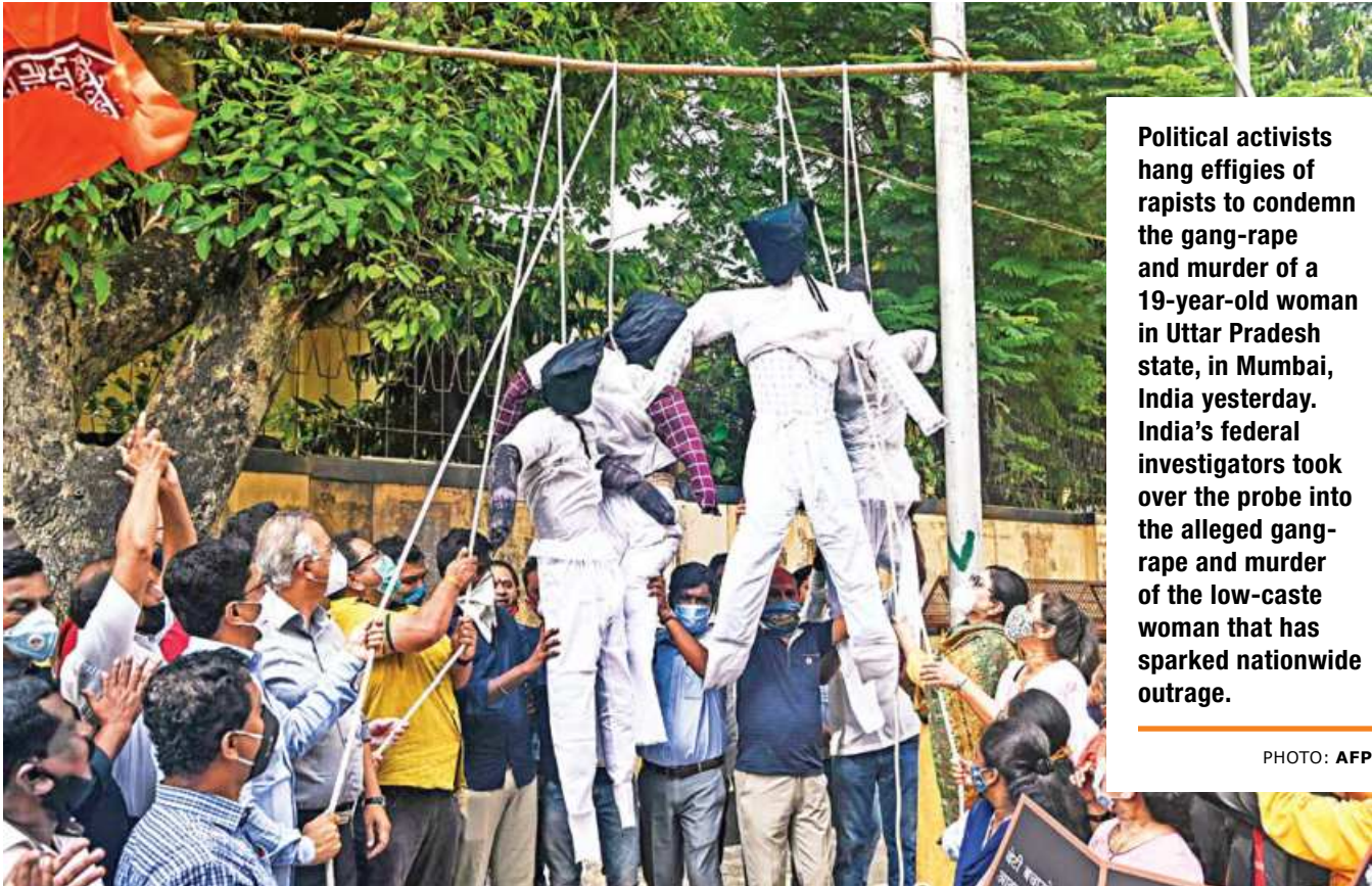
Political activists hang effigies of rapists to condemn the gang-rape and murder of a 19-year-old woman in Uttar Pradesh state, in Mumbai, India yesterday. India's federal investigators took over the probe into the alleged gang-rape and murder of the low-caste woman that has sparked nationwide outrage.