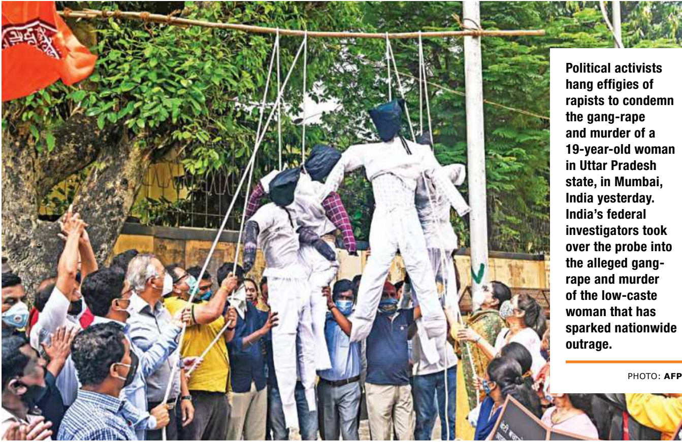
Political activists hang effigies of rapists to condemn the gang-rape and murder of a 19-year-old woman in Uttar Pradesh state, in Mumbai, India yesterday. India's federal investigators took over the probe into the alleged gang-rape and murder of the low-caste woman that has sparked nationwide outrage.