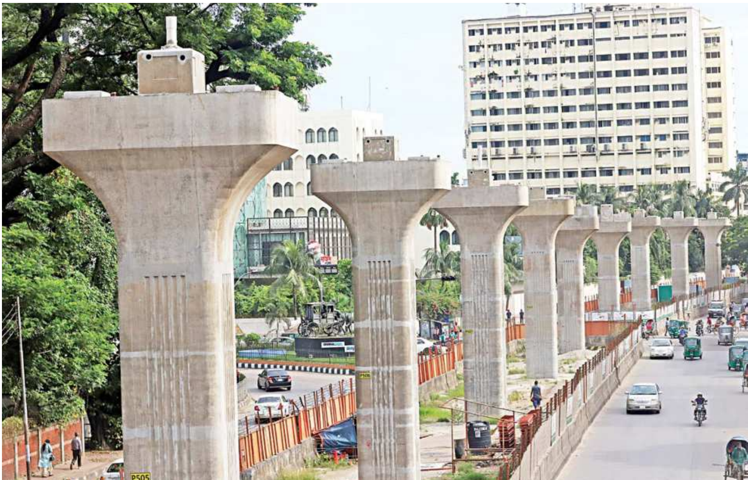
Columns have taken shape at the Poribagh section of the country's first metro rail project -- formally known as Mass Rapid Transit-6 or MRT Line-6. The metro rail authorities have taken initiatives to bring back more foreign engineers and consultants to accelerate the construction work of the elevated rail line from capital's Uttara to Motijheel at the cost of Tk 20,000 crore. Overall, it witnessed 49.15 per cent progress till August, according to project documents. The photo was taken recently.