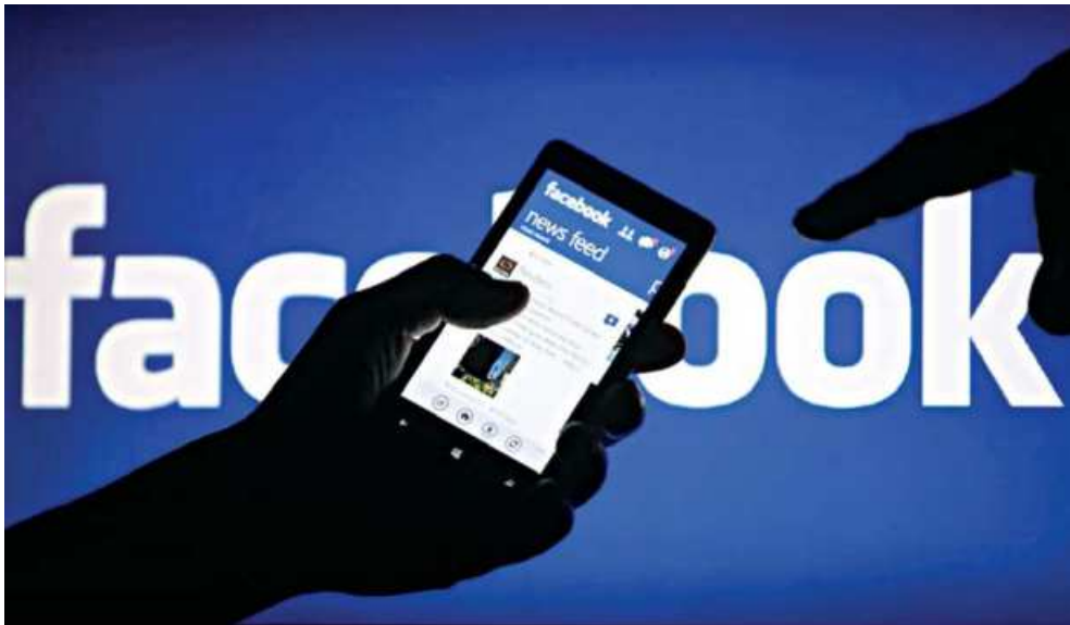
Facebook has at least 98 different data points that allow the organisation to collect various data on individuals.

On the other hand, data privacy goes beyond the PII of its employees and customers for businesses. It also includes the information that helps the company operate, whether it is proprietary research and development data or financial statistics that show how it's spending and investing its money.