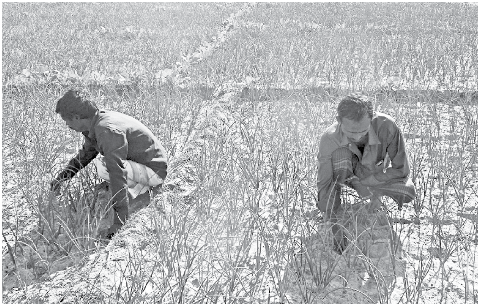
Workers tend to an onion field in Kisamoter Char area of Dimla upazila in Nilphamari.

"We will arrange motivational and training programmes as well as provide technology and quality seeds to encourage farmers in cultivating profitable crops, particularly onion. This way, we will achieve self sufficiency in onion production, like we already did in the case of rice and meat production," he also said.