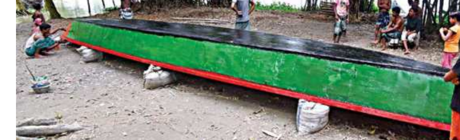
Villagers painting an almost 42-foot long boat, which will be used in a local rowing championship in Bogura's Sariakandi upazila. The competition, to be held on the Bangali river, is a decades-old custom.