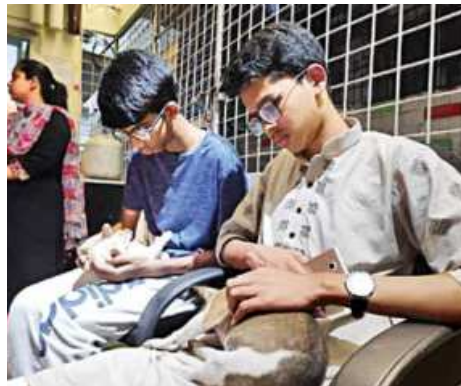
Happy Tails volunteers at a veterinarian's clinic with rescued animals.