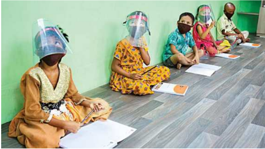
The team of Chakar School are currently conducting classes, following safety and social distancing guidelines as strictly as possible.