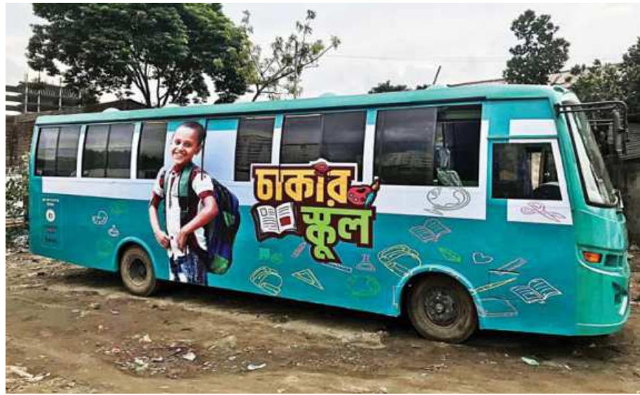
(L) The bus, Chakar School, operates in different slum areas of the city. (R) Teachers and students of Chakar School are equipped with face masks, face shields and other safety precautions during classes.