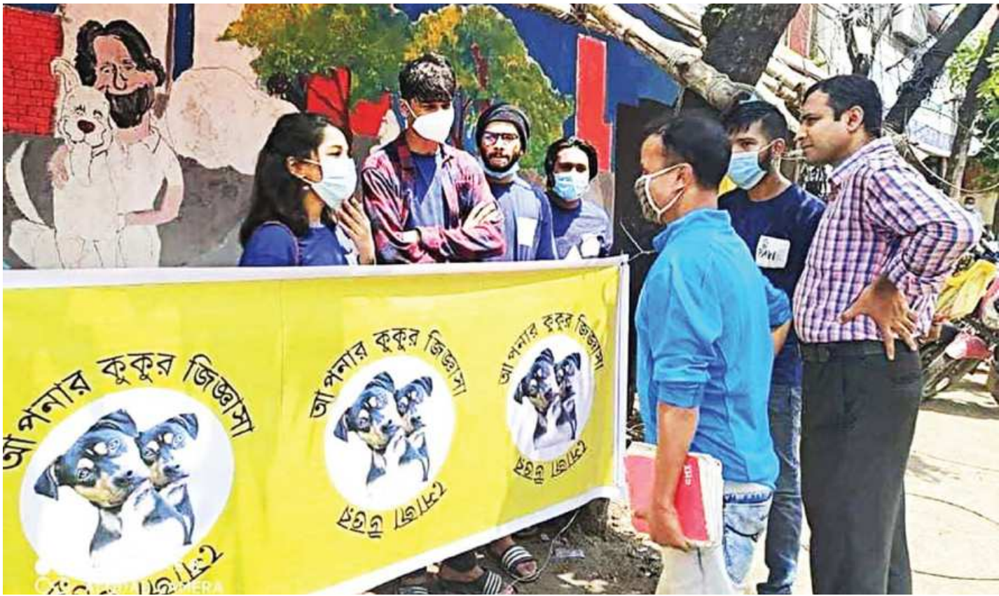
Happy Tails volunteers protesting DSCC's decision to relocate stray dogs outside the capital.