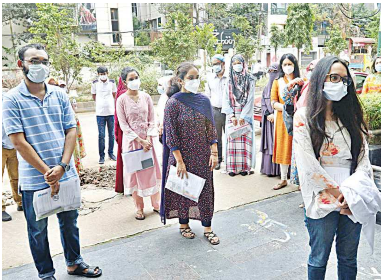
Wearing masks and maintaining physical distancing, a group of A-Level students waits to enter a British Council-approved test centre in the capital's Dhanmondi area around 11:00pm yesterday. Advanced Level examinations of the October and November session began yesterday amid the pandemic, leaving many candidates and their guardians in anxiety over health safety.