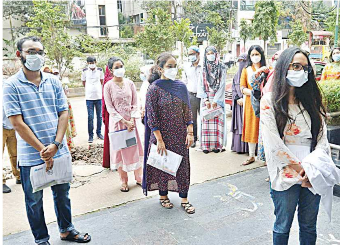
Wearing masks and maintaining physical distancing, a group of A-Level students waits to enter a British Council-approved test centre in the capital's Dhanmondi area around 11:00pm yesterday. Advanced Level examinations of the October and November session began yesterday amid the pandemic, leaving many candidates and their guardians in anxiety over health safety.